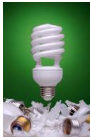
Table-1: CFL Bulb

In Bangladesh, CFL bulb set was introduced at least five years back by Transcom Electronics Ltd. Till 2010 the production of CFL by the Transcom Ltd. was 3200000 bulbs. It has been increased 35% of total year to year. The lifetime of a CFL bulb is not more than 1 year to 18 months. Therefore, it can be said that in last 5 years the number of rejected bulbs of Transcom were 5253313 pieces. There are also six other companies produce CFL bulbs in Dhaka city (e.g. Energy pac, Osaka, Onik, Delta, SKS and Rangs.)